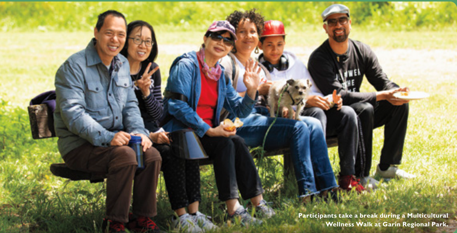
Participants take a break during a Multicultural Wellness Walk at Garin Regional Park.