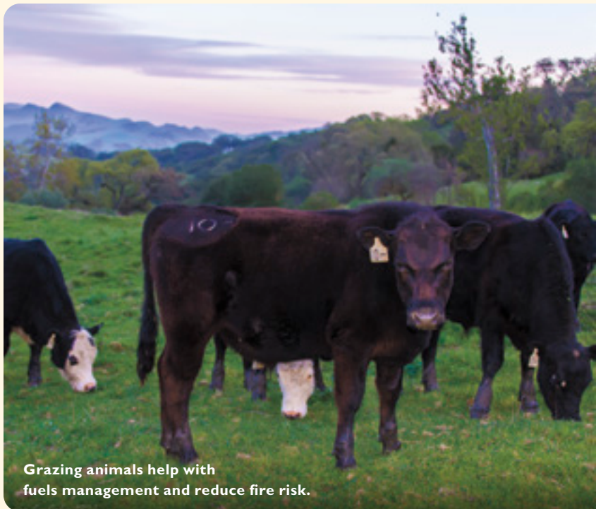
Grazing animals help with fuels management and reduce fire risk.

"WE GRAZE MORE THAN 1,600 ANIMALS PER YEAR—SHEEP, GOATS AND CATTLE— [TO MITIGATE FIRE RISK]. WE WERE ONE OF THE FIRST AGENCIES IN THE EAST BAY TO GRAZE."