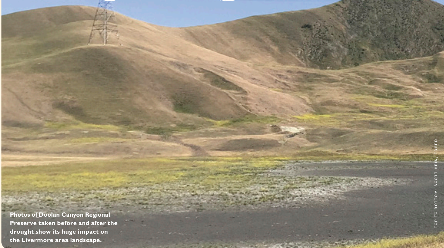
Photos of Doolan Canyon Regional Preserve taken before and after the drought show its huge impact on the Livermore area landscape.