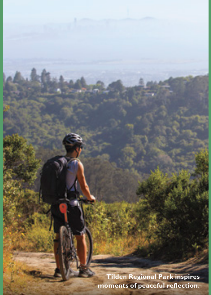
Tilden Regional Park inspires moments of peaceful reflection.