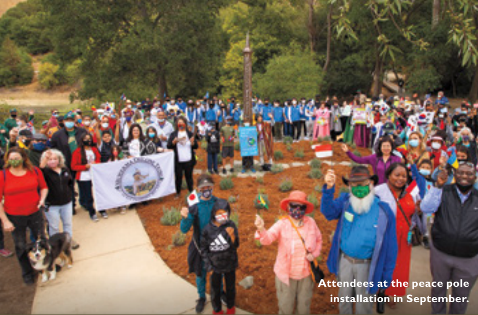
Attendees at the peace pole installation in September.