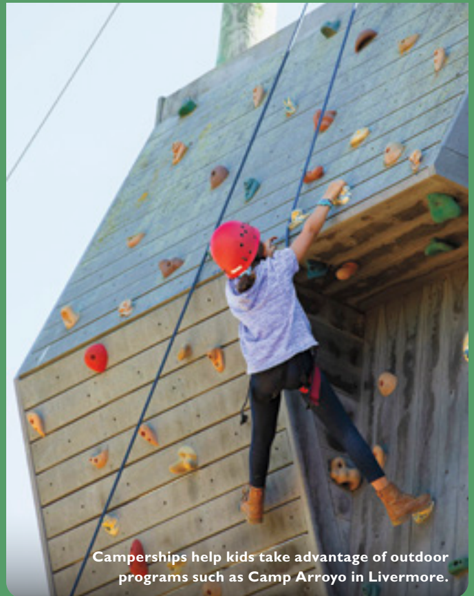
Camperships help kids take advantage of outdoor programs such as Camp Arroyo in Livermore.