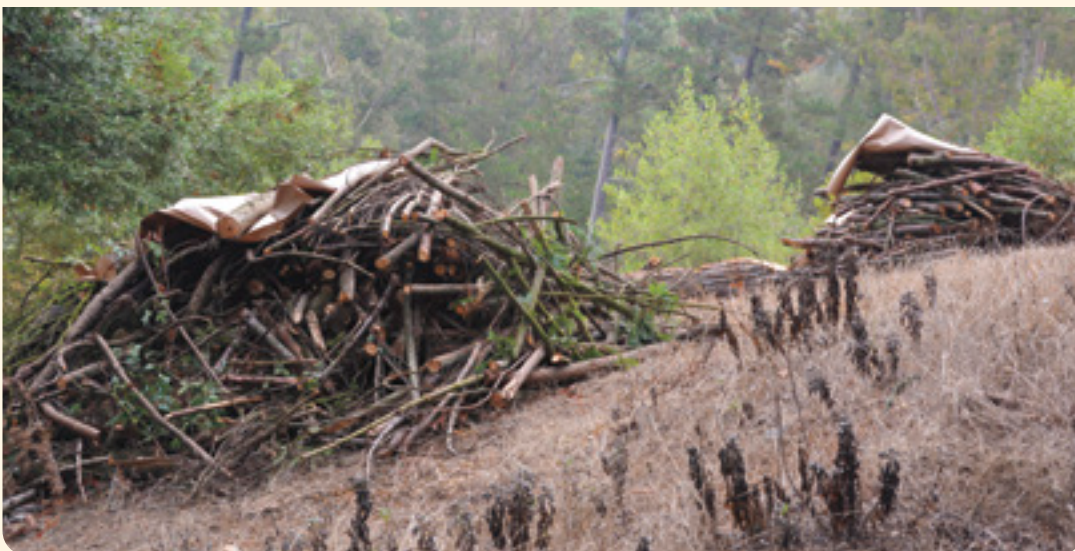
Clockwise from top left: District fire crews reduce vegetation and dead trees as part of fuels management; sudden tree death is affecting approximately 1,500 acres of trees in parks such as Tilden and Reinhardt Redwood.

CLOCKWISE FROM TOP LEFT: CALI GODLEY (2), EBRPD (2)