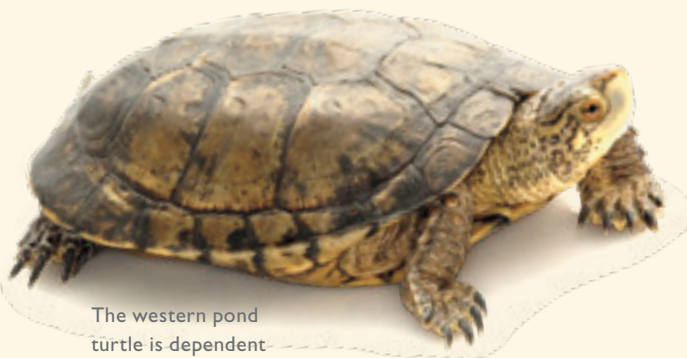
The western pond turtle is dependent on seasonal waters.

Some of the 500-plus ponds in the District are natural, but most were created. Work is being done to expand several ponds and also ensure their bottoms have a good clay layer to retain water longer. Graul says the District is prioritizing additional funding to accelerate pond restoration.