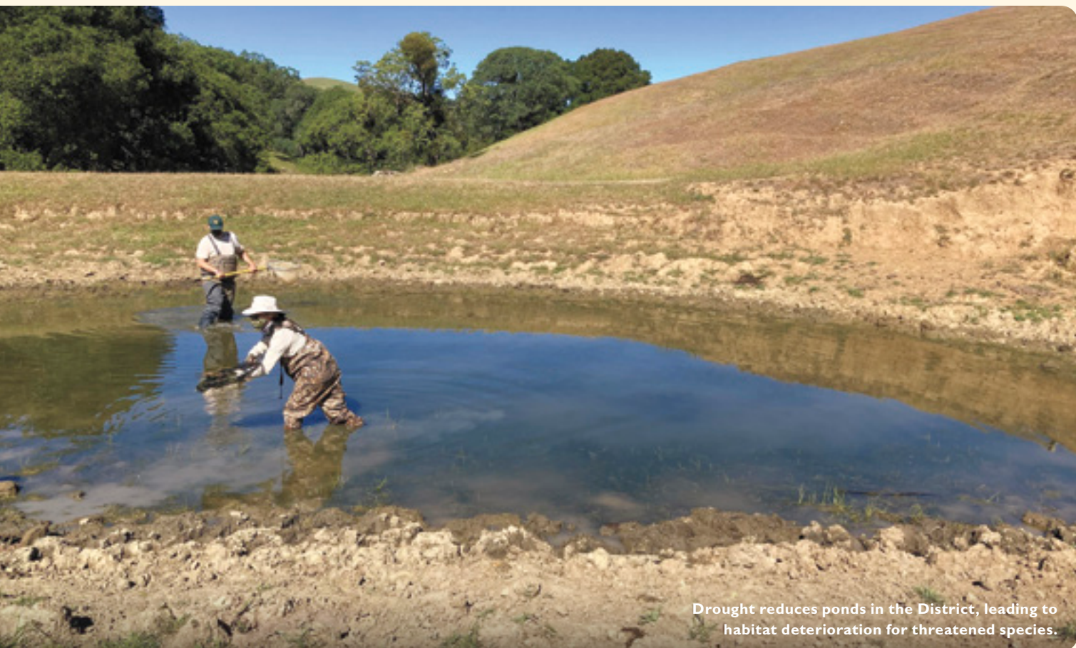
Drought reduces ponds in the District, leading to habitat deterioration for threatened species.